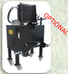
Hydraulic system for tractors