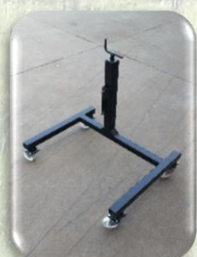
Supporting trestle with wheels