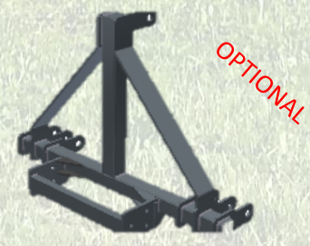
Third point coupling element