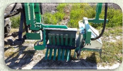
Shoot tipping head with whips