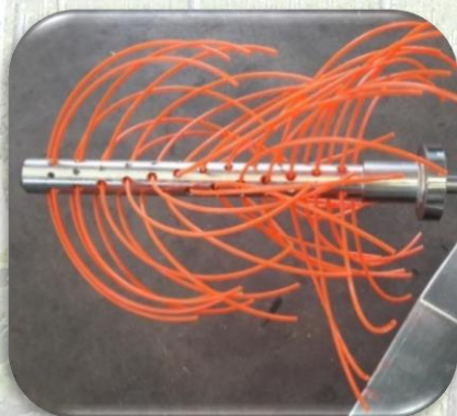
Roll interchangeably with nylon cord