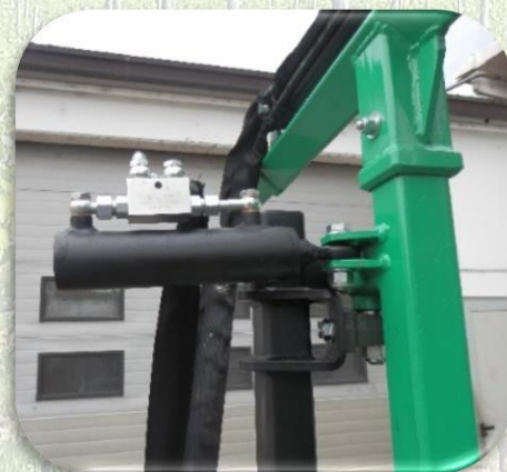
Cilindro per il rientro del braccio scavallante