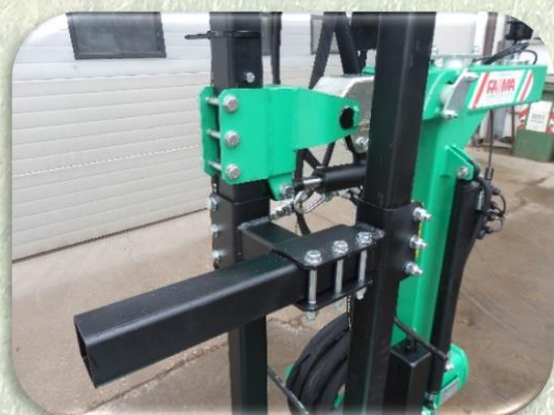
Regolazione profondità della testata spollonatrice interna