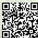
Scan for video

Rivenditore - Dealers - Revendeur - Händler