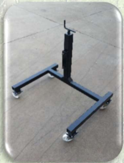
Supporting trestle with wheels