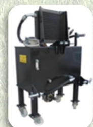
Hydraulic system 50 L oil, capacity 40 L/Min.