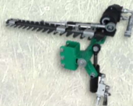
Horizontal bar with mechanic inclination dx