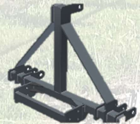
Third point coupling element