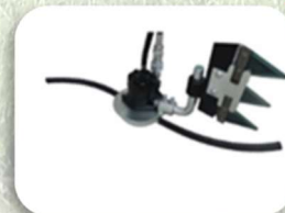
Shoot conveyor for vertical bars