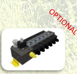
Electric control distributor allowing n. 5/7 movements