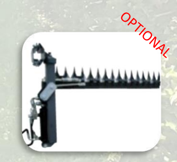
Topping horizontal bar 1.50 m long equipped with shockproof spring and with cylinder for hydraulic return

Topping horizontal superior bar with inclination