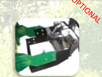
Universal flange with two modes of connection