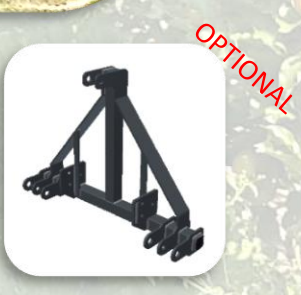
Third point coupling element