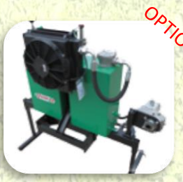
Hydraulic system to be applied to an all-purpose tractor