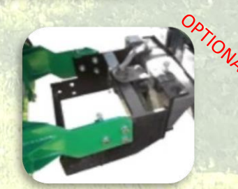
Universal flange with two modes of connection