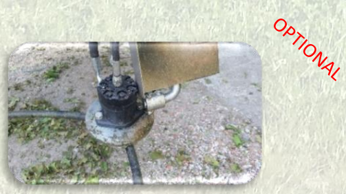
Shoot conveyor for vertical bars