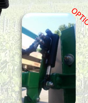
Hydraulic inclination of the vertical bar (RIGHT)