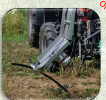
Cutter sylvose with hydraulic motor Inc.(45°)