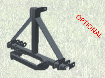
Third point coupling element