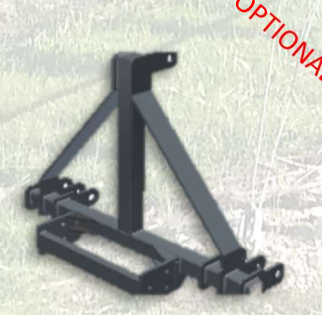
Third point coupling element