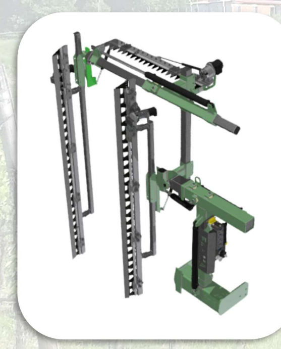
CL 200 Scavallata

Standard equipment: Self-sharpening single-blade vertical bar 1.80 or 2.10 m long (no maintenance), Supporting trestle with wheels and Flanging system