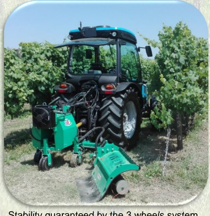
Stability guaranteed by the 3 wheels system

Independent hydraulic system for the powering of the roller motor. The translation and inclination controls of the header are moved by quick couplers connected to the tractor's auxiliaries distributors.