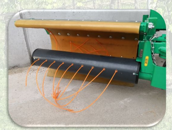
Roller with 9 reels of 9 MT of wire Ø 4 mm