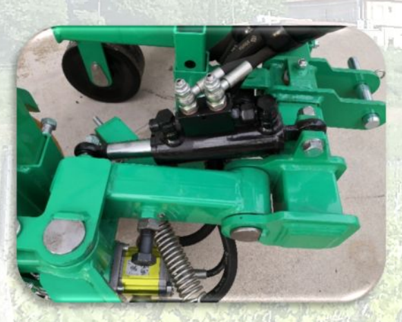
Header inclination of 60°